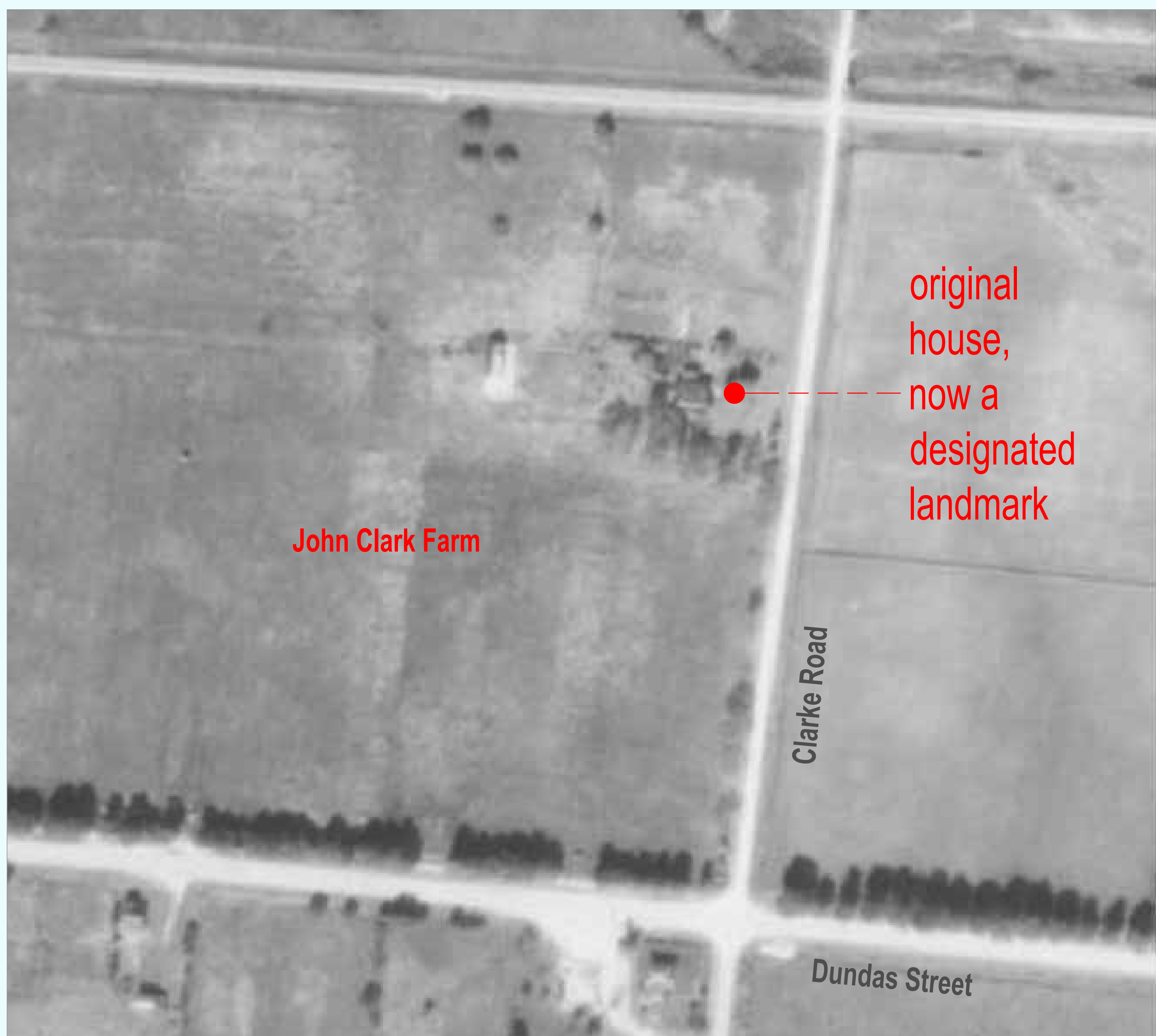
1945 Aerial View

The original Clark Farm comprised of 100 acres that were purchased and cleared by Irish Pioneer, John Clark in 1834. The boundaries of the farm extended from Clarke Road and Second Street in the east-west direction and Dundas Street to Herbert Avenue in the north-south direction.